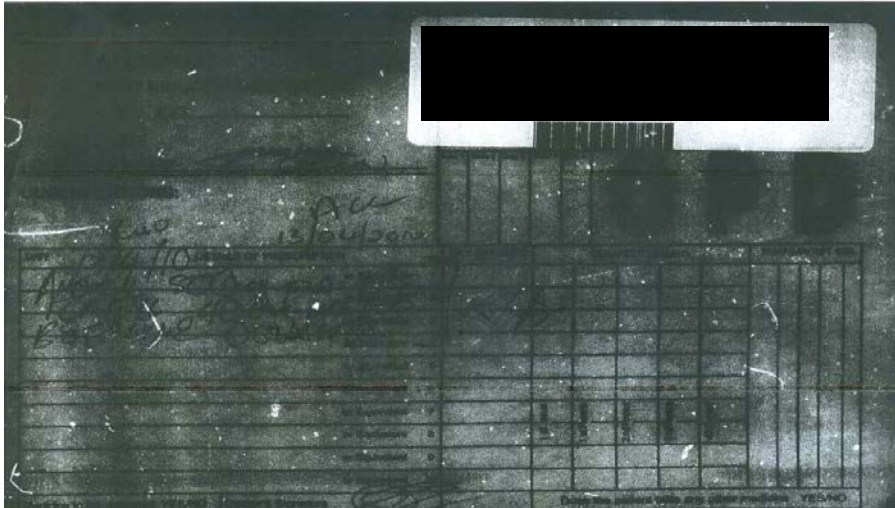
Figure 1: Example of quality defect

Most documents scanned arrive as DIN A4. However, in the absence of standardised document sizes, up to 10% of them arrive in other sizes, thicknesses, or colours, making standardisation difficult and causing paper jams.