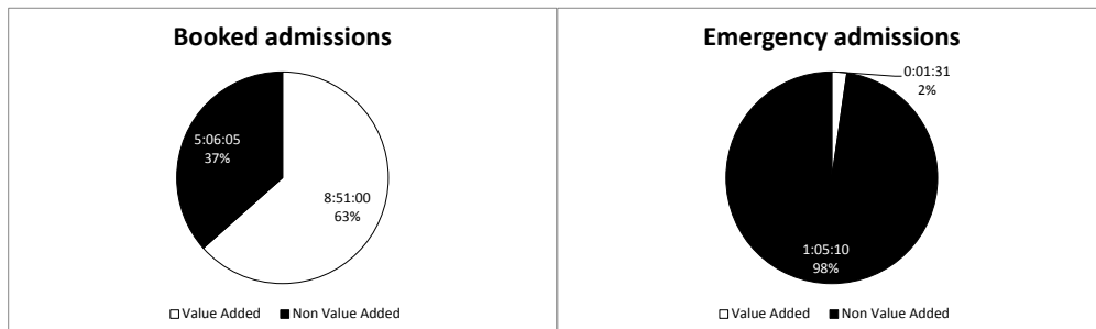
Figure 2: Value-Added vs. Non-Value-Added analysis for record retrieval admissions

Value-stream mapping the unit showed that non-value-adding (NVA) steps account for about 40% (see Figure 2). Waste is largely due to movement. As can be seen for emergency admissions, the NVA component is overwhelmingly larger (98%). This is due to the time that the runner takes - more than an hour - to deliver the document.