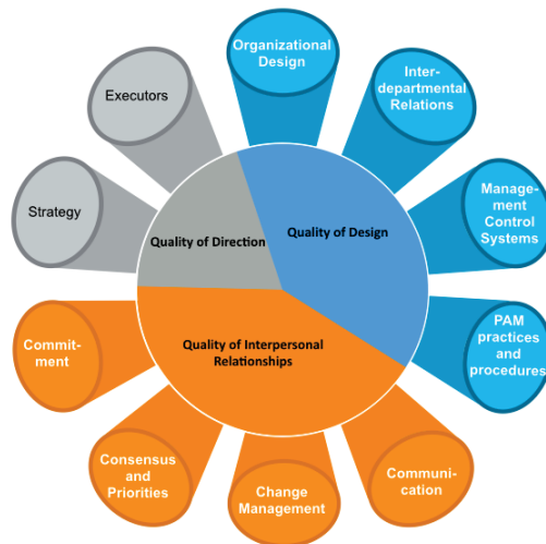
Figure 1: The deadly dectet of SEF

In order to simplify and structure the screening and detection process, it was decided to use the first three components of the PAMSE definition as a framework to categorise the nine casual factors. The fourth component, "contribution to the creation of sustainable competitive advantage", is treated as a lagging indicator. Furthermore, in the light of the evaluation of recent examples of PAMSEF, it was decided to include a tenth factor referring to "the non-adherence of generally accepted PAM practices and procedures". These ten factors, which are illustrated in Figure 1, are referred to by the author as "the deadly dectet of PAMSEF".