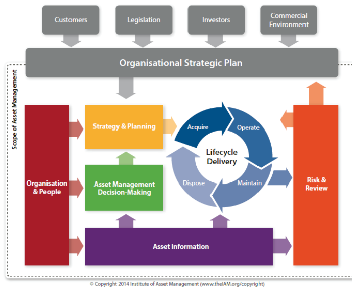
Figure 2: The IAM anatomy of AM